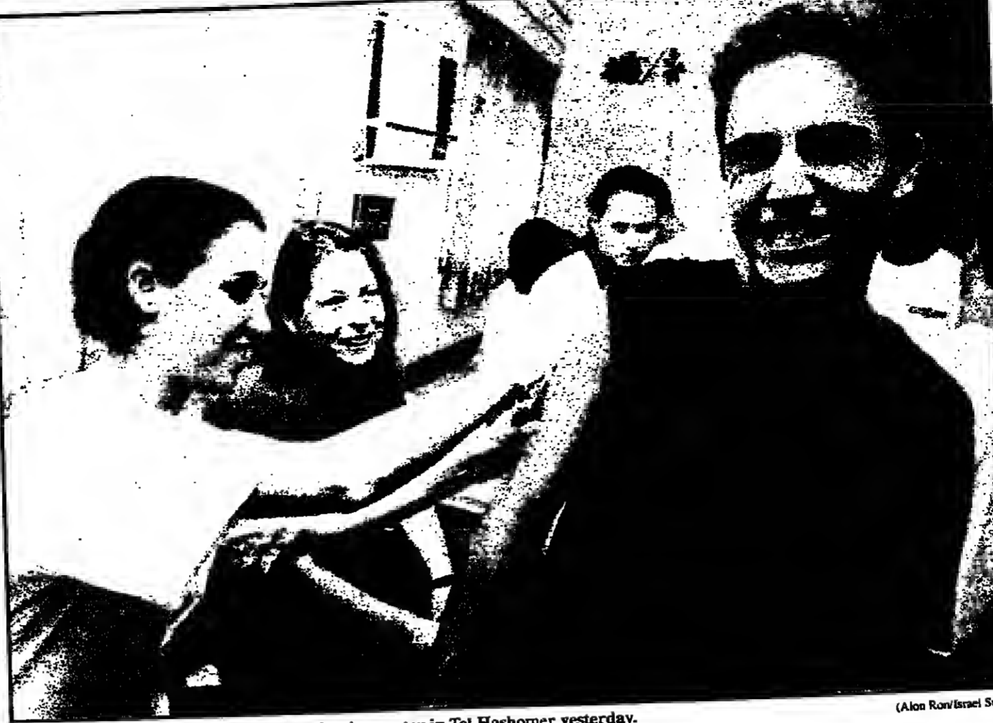
A new soldier receives his shots at the induction center in Tel Hashomer yesterday.

announcing this will be the last cut to the law's provisions. "We are worried that the government is working according to the salami system. First it will make one cut, then another, then another, until the law is completely scrapped," he said. The MKs who supported Cohen are Maxim Levy (Gesher), Rehavam Ze'evi (Moleket), Moshe Shahal (Labor), Shlomo Benizri (Shas), Anat Maor (Meretz), Shaul Yahalom and Avraham Stern (National Religious Party), Eliezer Zandberg (Tomet), Emanuel Zissman (Third Way), and Moshe Gafni (United Torah Judaism). Others are expected to join the initiative before the bill comes up for discussion in the plenum, probably in October, after the summer recess.